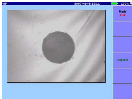
Clean optical connectors ensure your network is operating to its potential.

Connector images are captured digitally and displayed on the test set screen. The images can then be viewed or saved as a variety of common graphics files for later review or documentation of connector quality. Various adapters are available to allow direct viewing of patch cord end faces, as well as, for viewing of end faces already installed in patch panels. Furthermore, since there is no path to the human eye the VIP application eliminates the possibility of injury as with traditional connector microscopes.